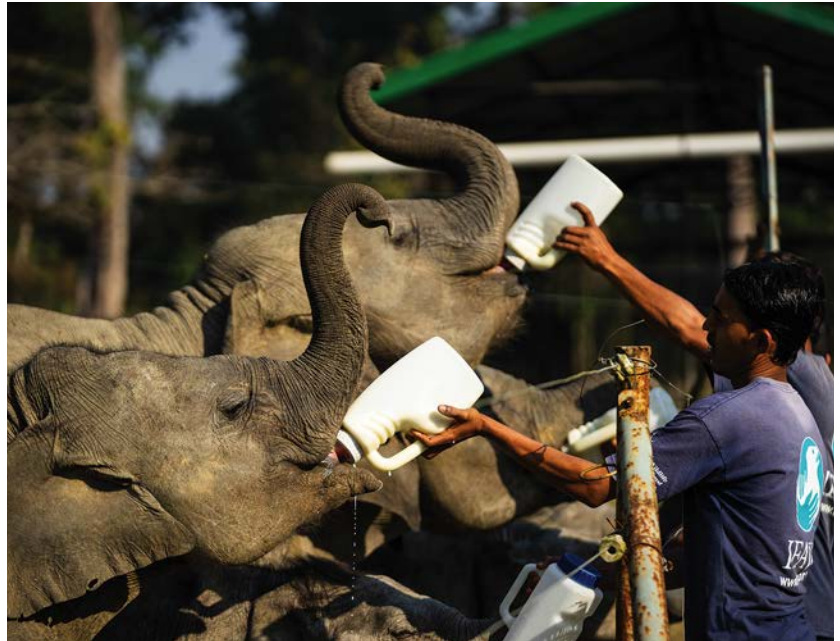
▲ Animal keepers hand feed rescued elephants at the Center for Wildlife Rehabilitation and Conservation near Kaziranga National Park in Assam, India.

A “One Health” approach encourages multiple sectors to communicate and work together to achieve better health outcomes for humans, animals, and ecosystems, and is particularly relevant for combatting the spread of zoonotic disease. “One Welfare” extends and complements the “One Health” approach by highlighting the interconnections between animal welfare, human well-being, and the environment, promoting the links between human welfare and environmentally friendly animal-keeping systems.