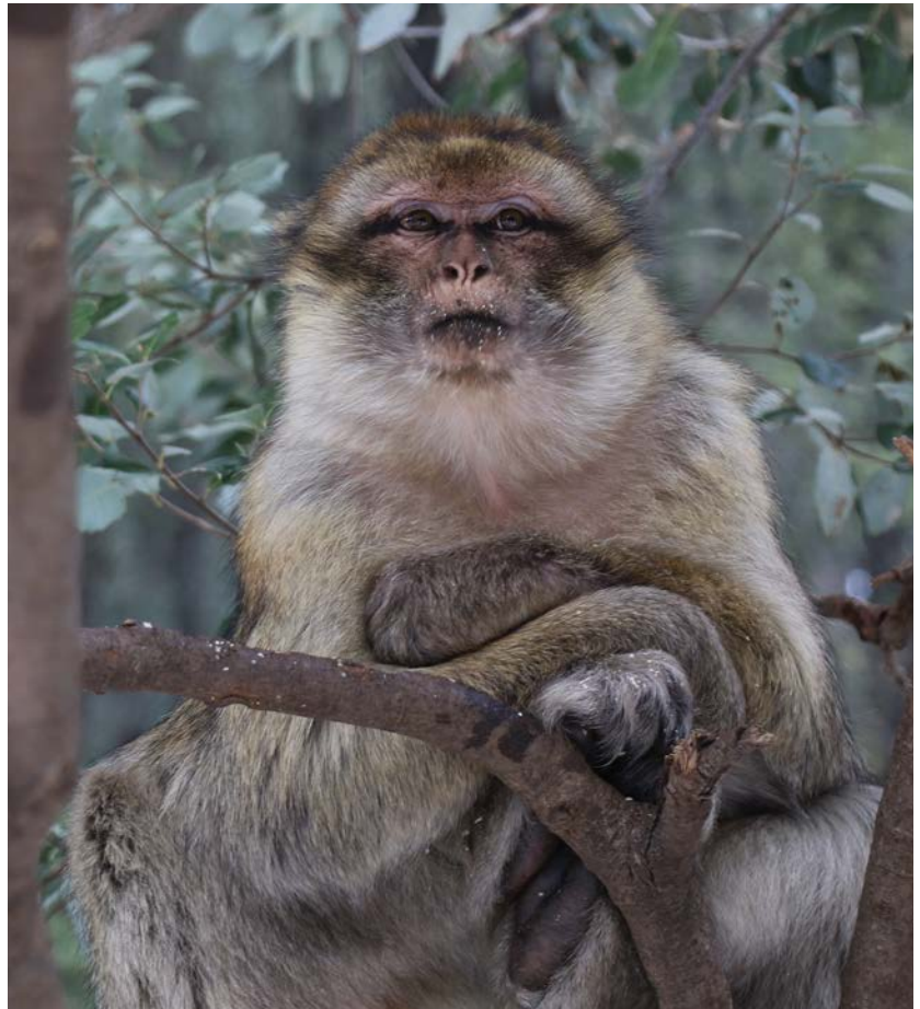
▲ Barbary macaques, an endangered species of monkey that live mostly in Morocco, are illegally sold to be pets in Europe and North Africa.