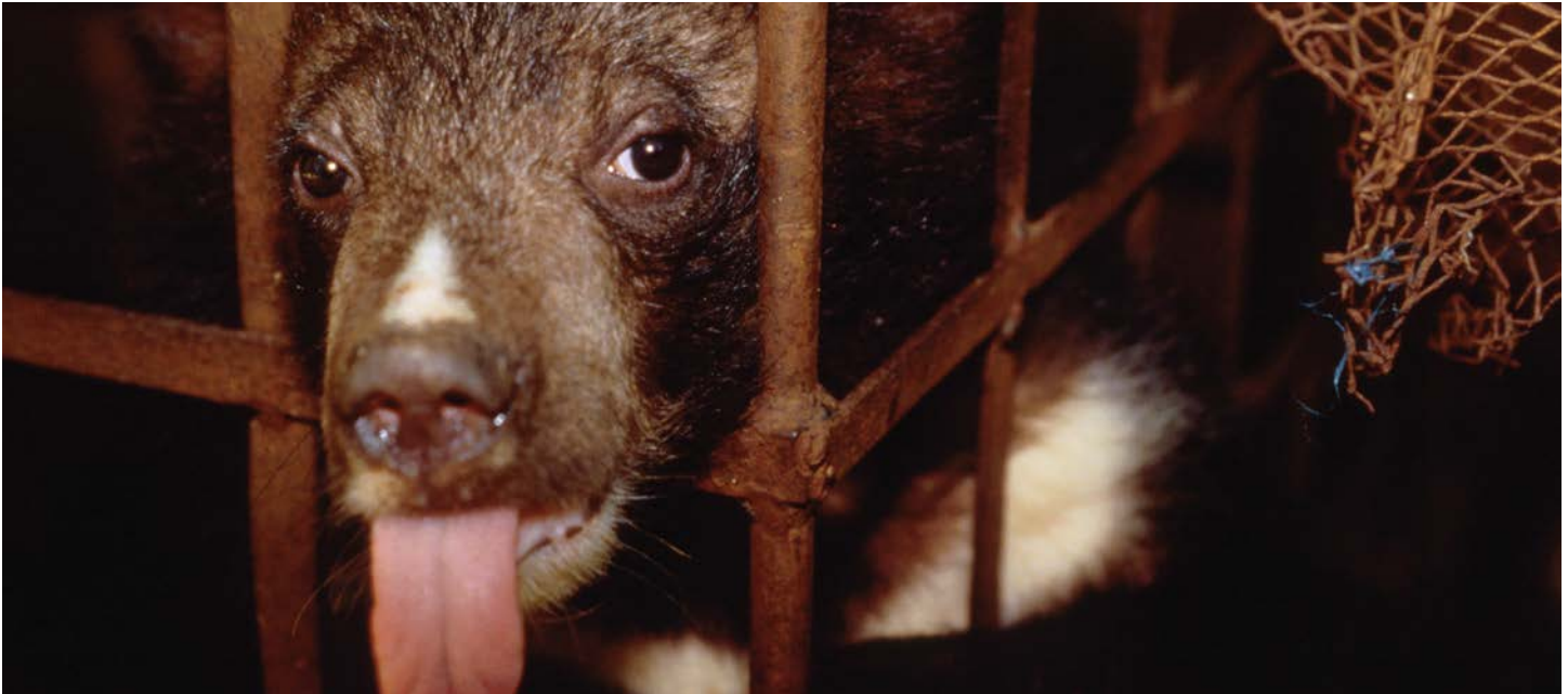
▲ A captive moon bear in Vietnam pokes its snout through the rusty bars of a small metal cage.