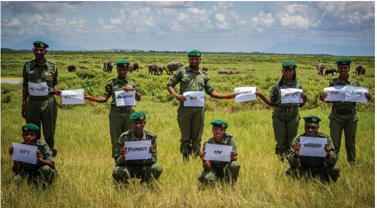
▲ Olgulului Community Wildlife Rangers spread awareness of safety measures during the COVID-19 pandemic in Amboseli National Park in Kenya. They urge residents to stay home while they protect the wildlife.