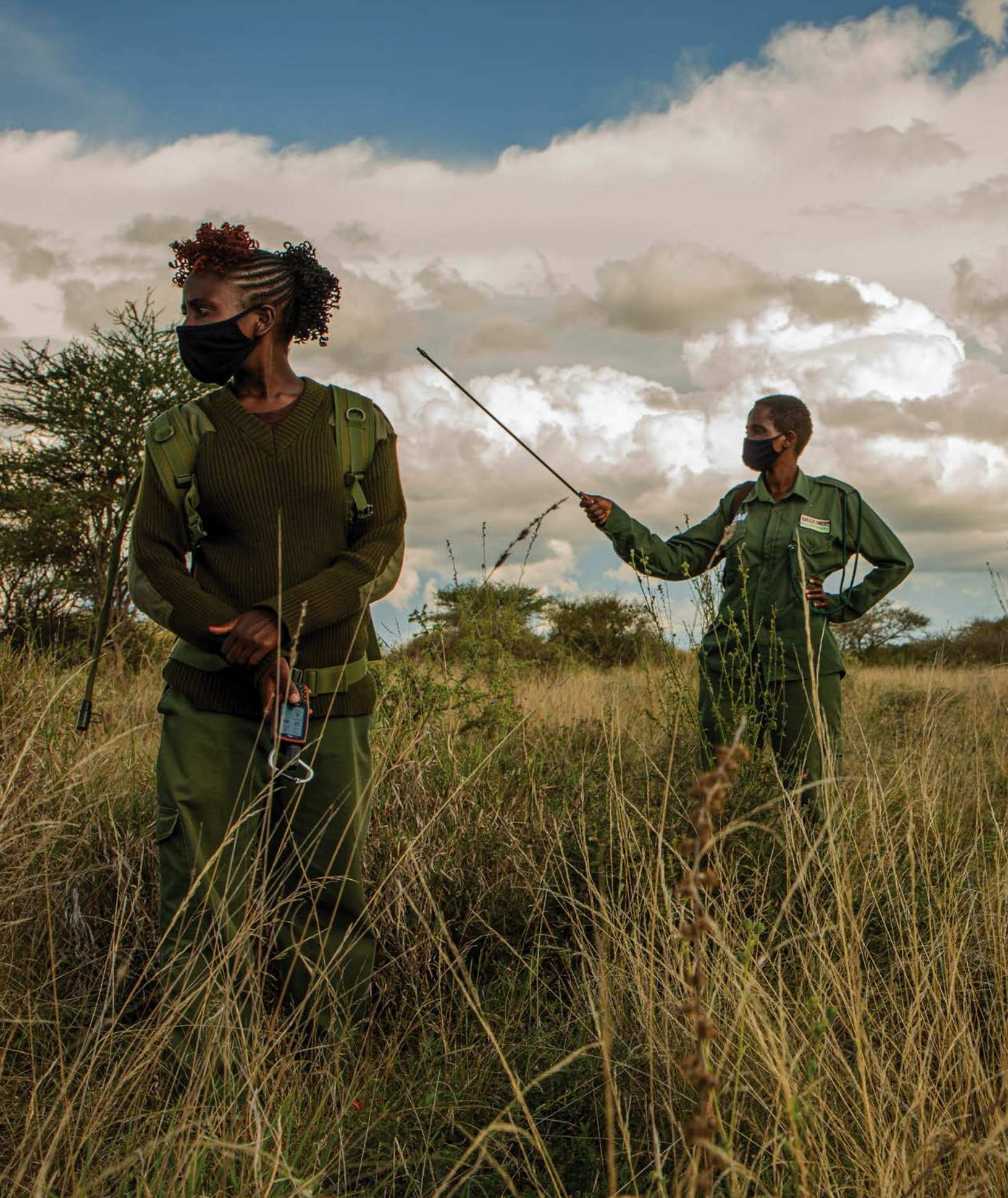
▲ Community wildlife rangers wear face masks while on patrol in the savannah of Kenya. These women are part of "Team Lioness" which is one of Kenya's first all-female wildlife ranger units.