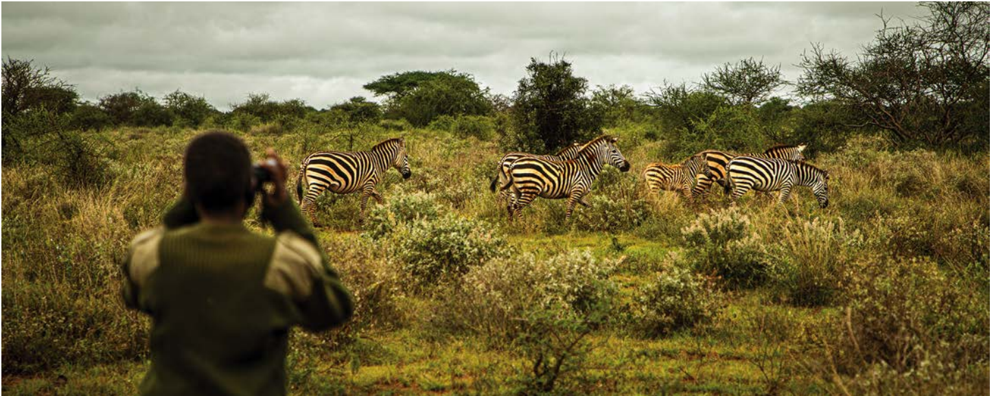
▲ A Kenyan ranger observes a herd of Zebra in Kajjido, Kenya.