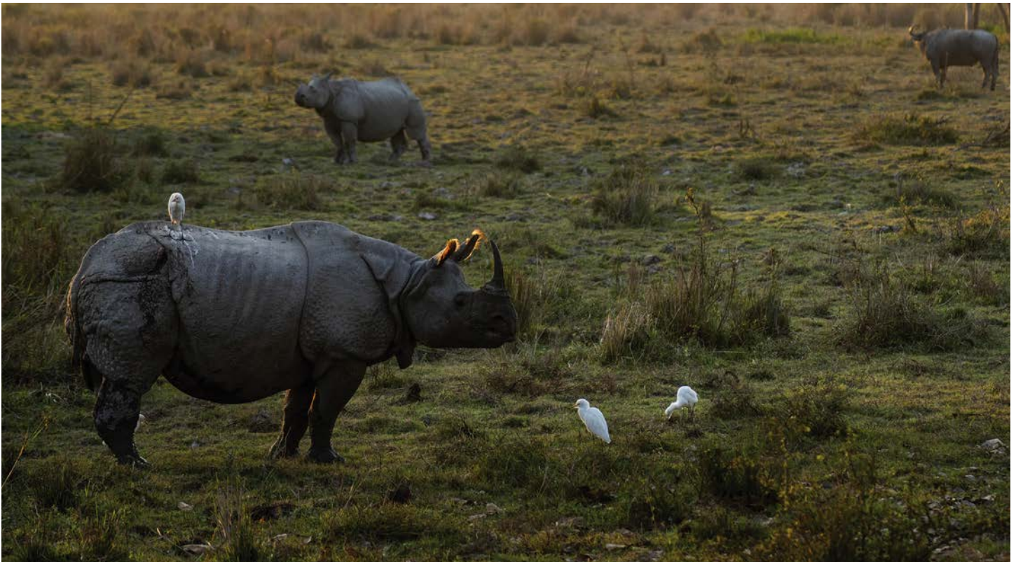
▲ Wild rhinos roam the grasslands of Kaziranga National Park in Assam, India.