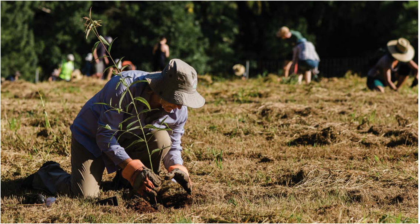
▲ Australians help plant trees to restore critical koala habitat that was lost in the record-setting wildfires of early 2020.