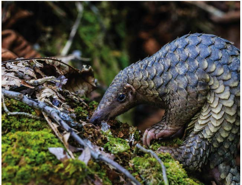
▲ A Sunda pangolin that was successfully released into the wild after rehabilitation in Borneo.

HIV and Ebola are also examples of diseases that were introduced to human populations due to the wild animal trade. Expanded logging and mining in remote regions of Africa brought humans into sustained contact with