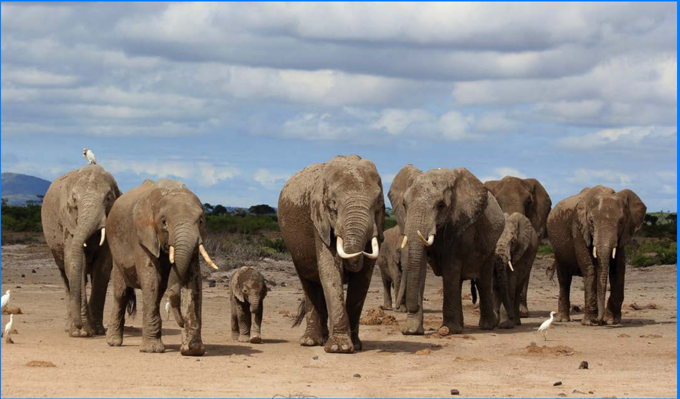
▲ A herd of elephants in the Amboseli ecosystem of Kenya.

The Amboseli Ecosystem in southern Kenya is home to some of Kenya's largest thriving elephant populations (est. 2,000), 92 however, the only protected area is the 392-square kilometer Amboseli National Park. 93 Elephants are long-ranging mammals with home ranges of up to 3,000 square kilometers per individual. 94 The park is therefore too small to support this migratory species' ecological needs alone. It can only handle a maximum of 300 elephants, 95 leaving over 1,700 elephants in search of other territory. Elephants and other wildlife depend on the surrounding 5,700 square kilometers of Maasai community land for dispersal 96 and spend up to 80 percent of their time 97 on these community ranches.